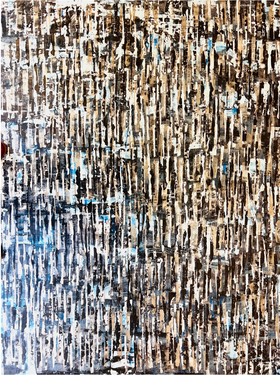
Diane Detalle De la Haut, 2024

50 x 68 in | 128 x 175 cm Acrylic on Canvas