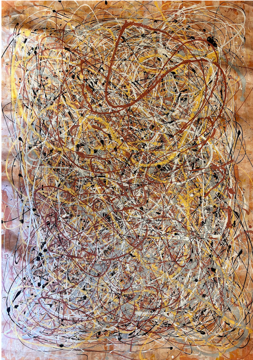
Diane Detalle Croisette, 2022

88 x 76 in | 223 x 193 cm Acrylic on Canvas