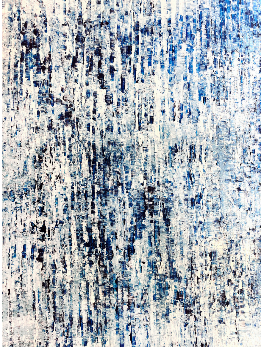
Diane Detalle Paloma, 2024

69 x 50 in | 175 x 128 cm Acrylic on Canvas