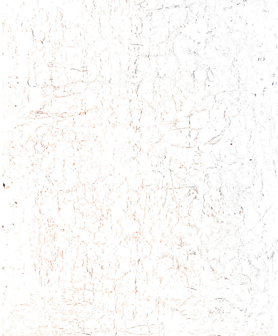
Diane Detalle Knowing, 2024

67 x 50 in | 170 x 128 cm Acrylic on Canvas