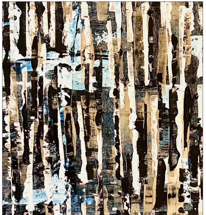
De la Haut