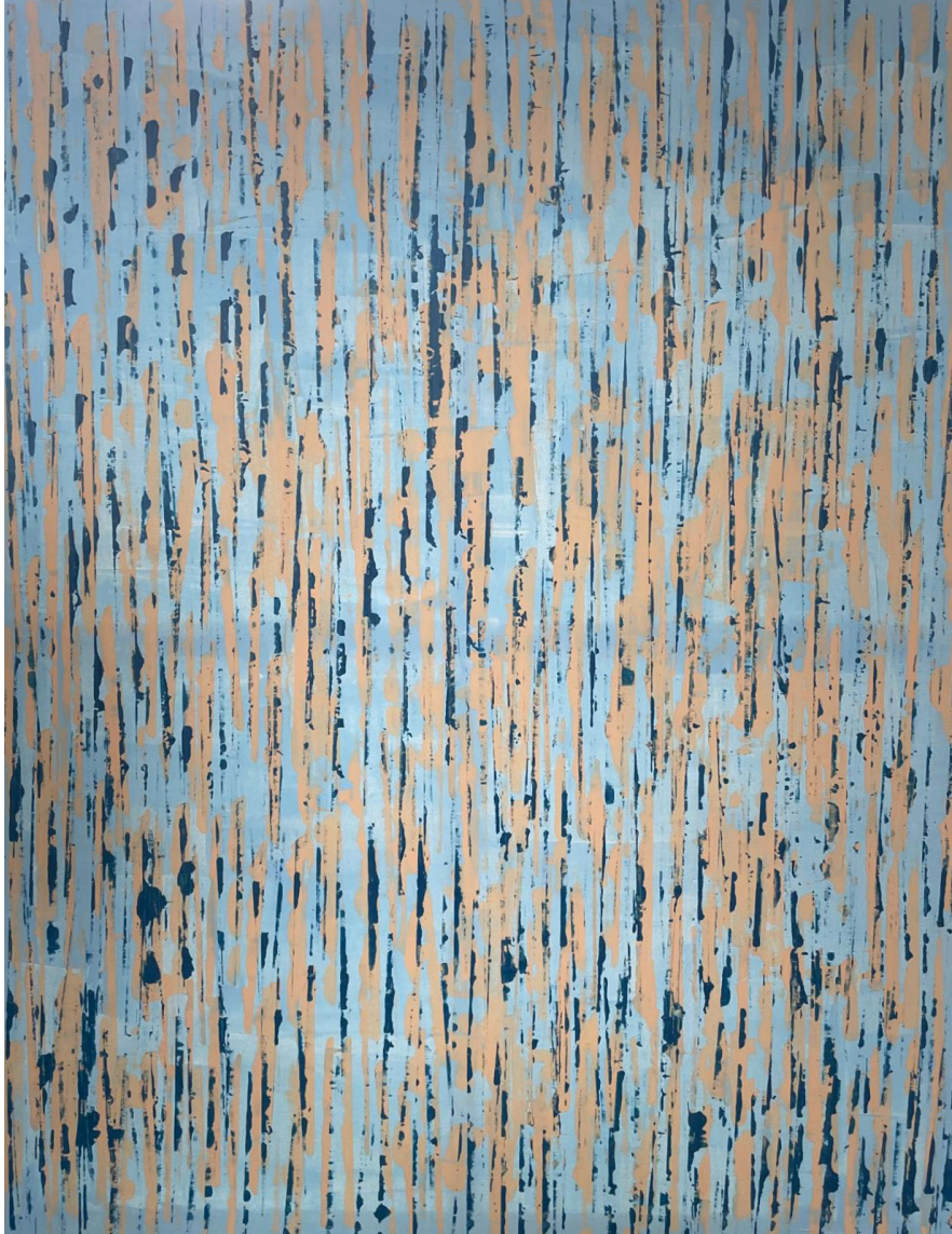
Diane Detalle Mediterranée, 2024

39 x 31 in | 99 x 79 cm Acrylic on Canvas