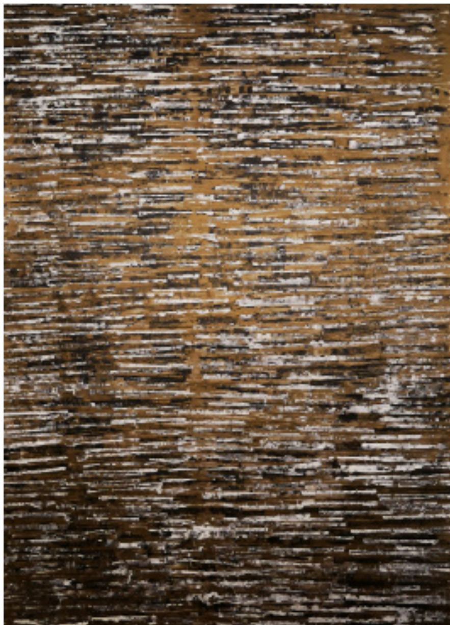
Diane Detalle Retour à la Source, 2024

45 x 85 in | 114 x 216 cm Acrylic on Canvas