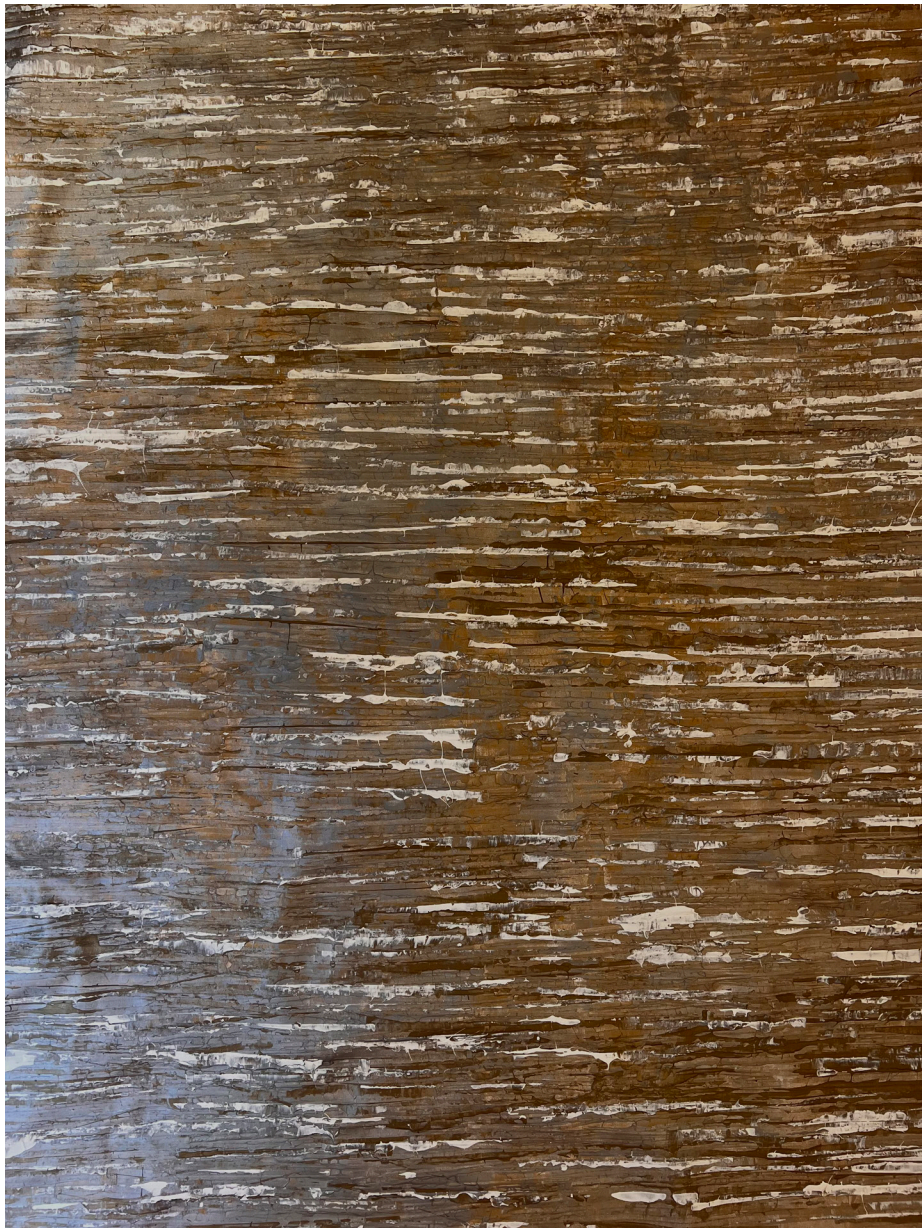
Diane Detalle Saint Jean Cap Ferrat, 2024

60 x 73 in | 152 x 186 cm Acrylic on Canvas