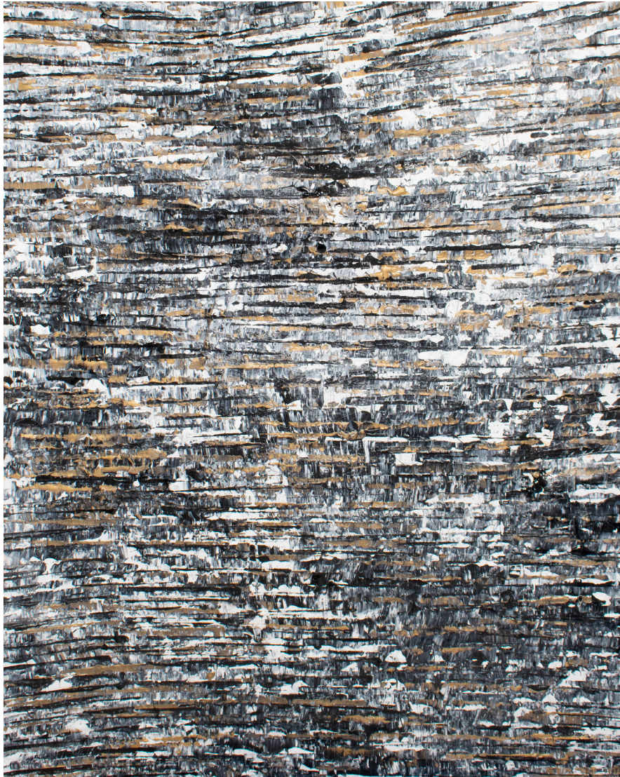
Diane Detalle Magic Fusion, 2024

66 x 50 in | 168 x 127 cm Acrylic on Canvas